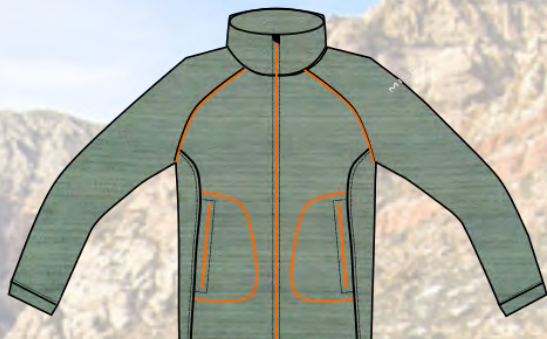
BENCUO grey melange

The children's collection takes young tourists and climbers straight to the mountain world, using materials and solutions that have proved their quality in our adult collections. 3 fleece jackets made of Polartec® 200 Classic® (Bencuo), Nanoqpile 2 (Jargo) and Nanoqpile 1 (Senge) will ensure thermal comfort at different temperatures, Neri pants made of Extendo 4-way stretch fabric will be perfect for exploring mountain trails, and Urru climbing pants made of strong, elastic cotton will help on the first climbing routes.