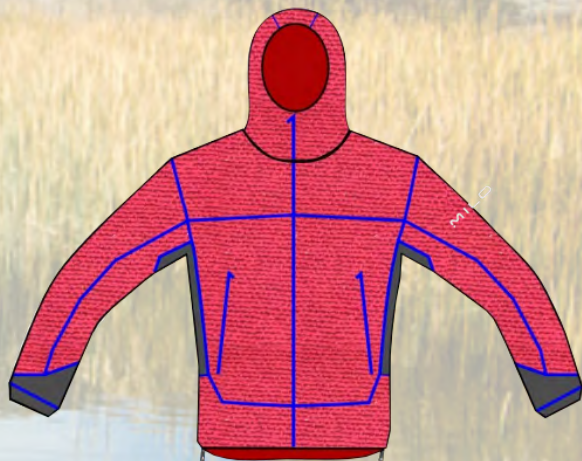
JARGO red textured