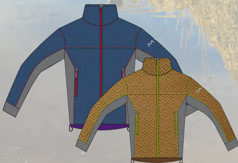
bijou blue / dark grey

Thin and movement-friendly training sweatshirt made of highly breathable Nanoqpile 1 fleece material with a three-dimensional structure, with inserts made of elastic Nanoqpile Stretch fleece. It is perfect as a second layer of clothing during cooler days and evenings spent in the rocks. Equipped with two pockets with zippers, adjustable hem and elastic cuffs that perfectly fit the wrists. Available in women's and men's versions.