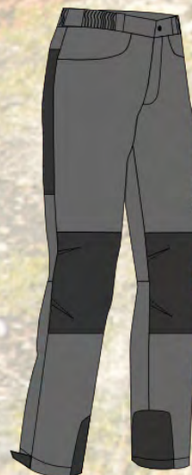
NERI grey / black