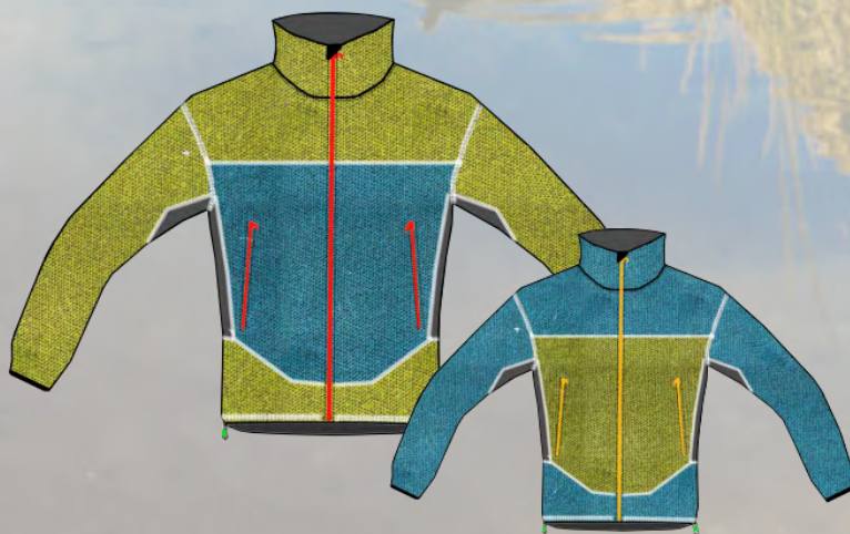
SENGE mirabelle / blue sky