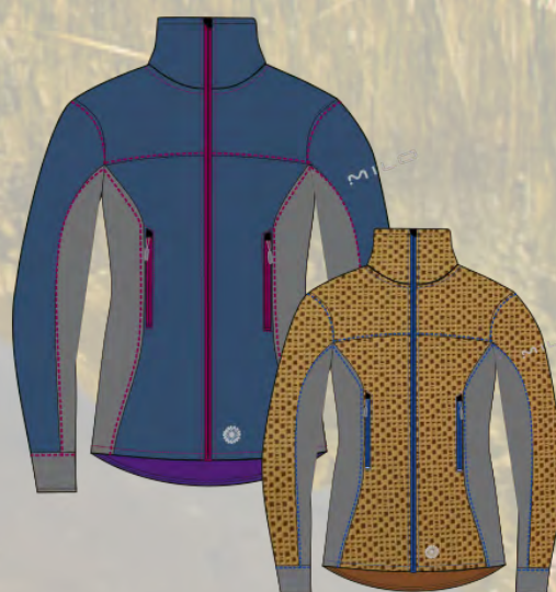
bijou blue / dark grey