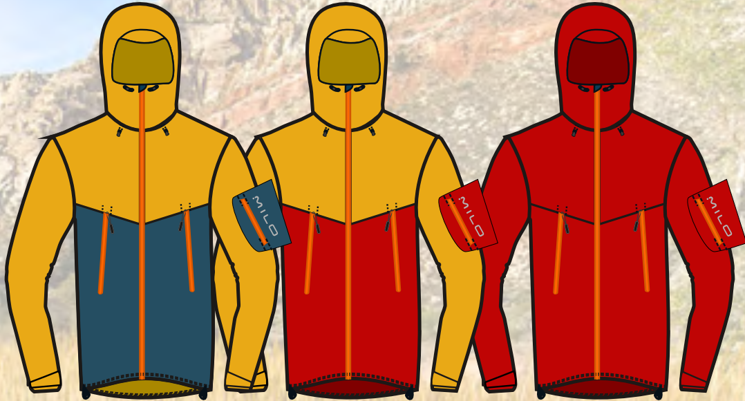
mustard yellow / blue lagoon

Simple, ultralight, waterproof and wind resistant jacket made of stretchable 2,5-layer Gelanots membrane. The parameters of the fabric are as high as 25000/60000 which combined with light weight, great packability and move friendly cut turn the Zacate jacket to a fantastic choice for all outdoor enthusiasts looking for a high performance water protection during their adventures. The jacket is equipped with two spacious and wide opening front pockets, two-way opened main zip with an additional snap button at the bottom for a better harness access, one additional arm pocket for a smartphone and an inner mesh pocket. Additionally 2 "gills" are placed under the arm pits providing better ventilation, the hood is adjustable in two dimensions for an optimal head or helmet fit and the cuffs are profiled and adjustable.