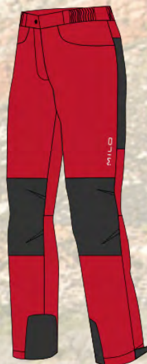
NERI red / black