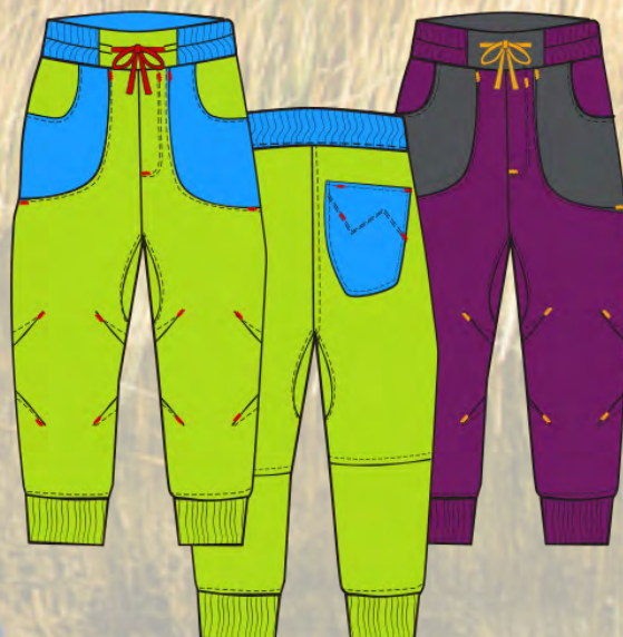
URRU mirabelle / blue sky